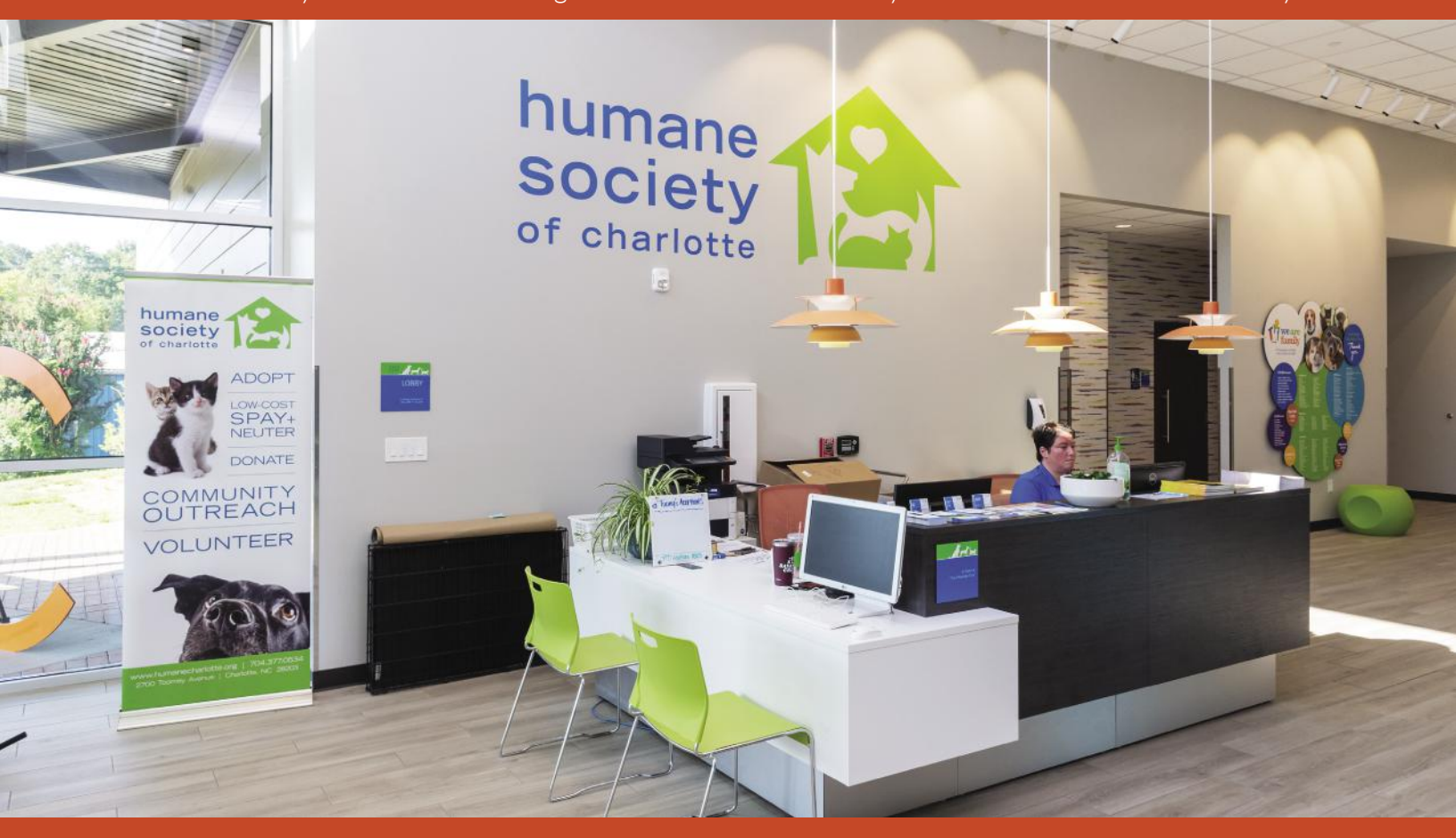
Case Study: Total Rebranding of the Humane Society of Charlotte's New Facility